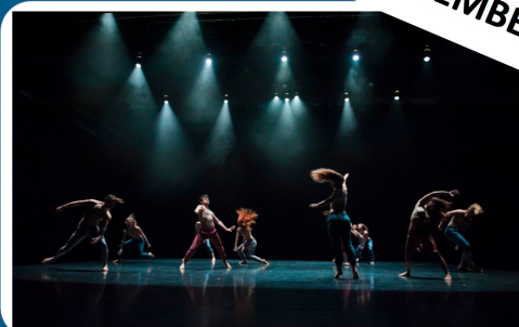
2015 – Image by Dylan Evans. QUT Dance Performance students in 'Chariot' by Lucas Jervies.

The career of a performing artist can often present challenges not just to an individual's physical wellbeing, but to their mental health and wellness. The understanding and application of performance psychology strategies across all areas of an artist's life, not just the performance side, has been observed to assist in supporting the development of a holistic approach to supporting individuals to be the best they can be - both on and off stage. This webinar looks to explore a range of key performance psychology and wellbeing topics, with the opportunity for questions and further discussions regarding this important area of performing arts healthcare.